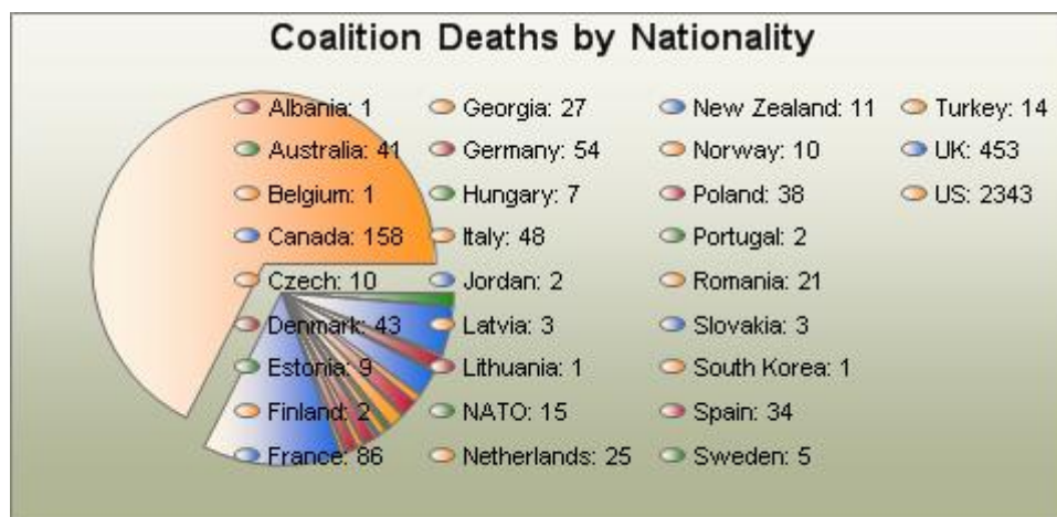
Figure 3: Casualties by nationality in Afghanistan