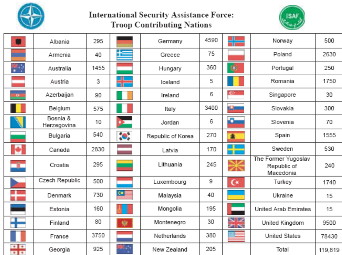
Figure 4: Troop contributing nations